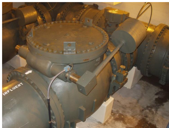
42" Figure 250-D with Option 1D Limit Switch

See Data Sheets 250.01 and 250.02 for smaller sizes