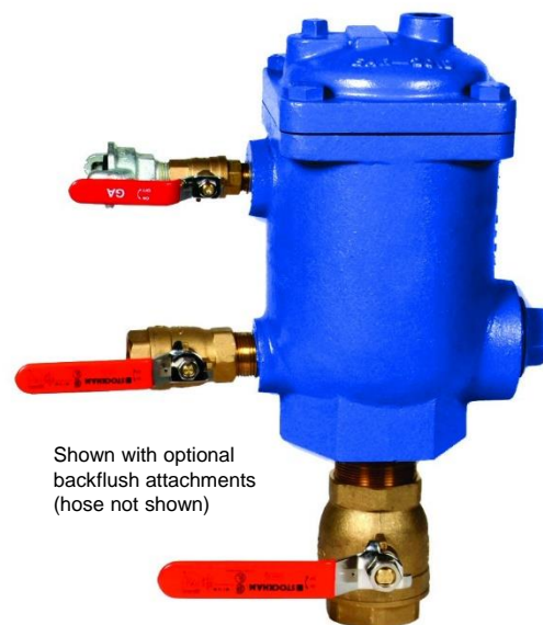
Shown with optional backflush attachments (hose not shown)