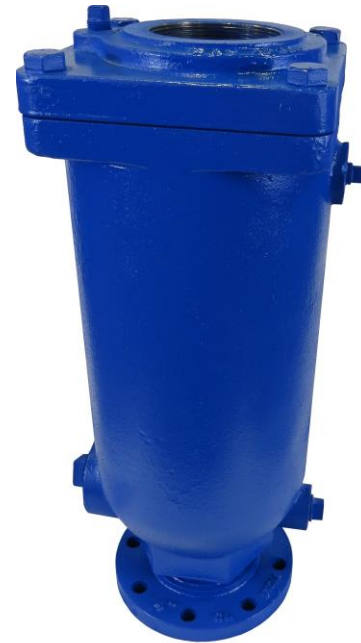
Figure 935-DF includes optional "back flushing attachments" to facilitate cleaning sludge and debris from the valve

Figure 935-D are typically installed at system high points where air and sewage gas naturally rise during filling, collect during operation and vacuum first forms during draining. The elongated body is designed to maintain an air gap between the solids bearing fluid and the valve's internal mechanism to minimize fouling and spillage.