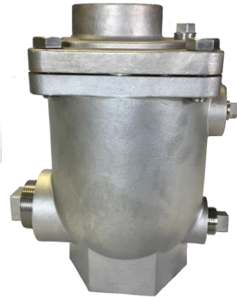
Figure 939SSF includes optional "back flushing attachments" to facilitate cleaning sludge and debris from the valve

Figure 939SS Air & Vacuum Valves are typically installed at system high points where air and sewage gas naturally rise during filling and vacuum first forms during draining. The valve's short body allows it to be used in shallow cover installations where a standard elongated body would be too tall.