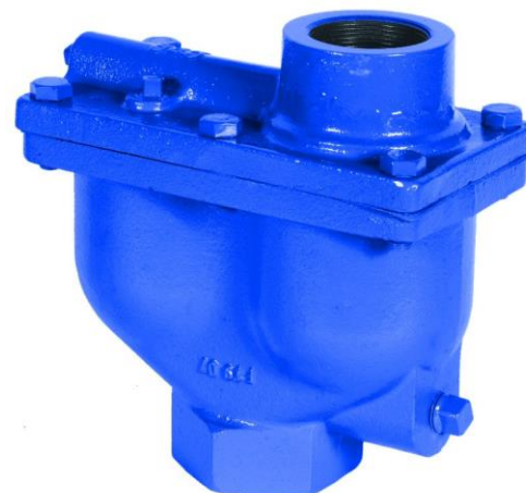
Data Sheet 945.01G