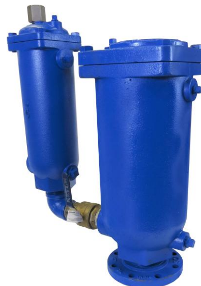
Figure 957-DF includes optional "back flushing attachments" to facilitate cleaning sludge and debris from the valve

Figure 957-D are typically installed at system high points where air and sewage gas naturally rise during filling, collect during operation and vacuum first forms during draining. The elongated body is designed to maintain an air gap between the solids bearing fluid and the valve's internal mechanism to minimize fouling and spillage.